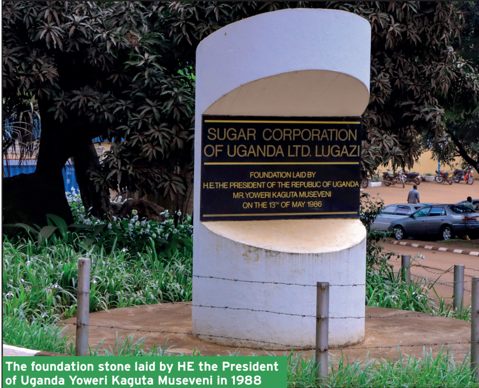
The foundation stone laid by HE the President of Uganda Yoweri Kaguta Museveni in 1988

Uganda, Yoweri Kaguta Museveni, was invited to lay the foundation stone of the new plant on the 13th of May 1986, shortly after he was sworn in as the President of Uganda. He came back to inaugurate the completed factory on 26th January 1988.